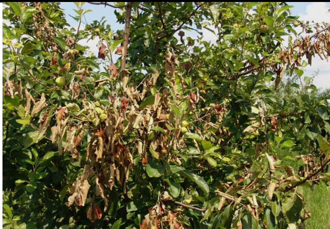
Fig. 3 Apple trees shoots attacked by fireblight Erwinia amylovora Burill. Winslow