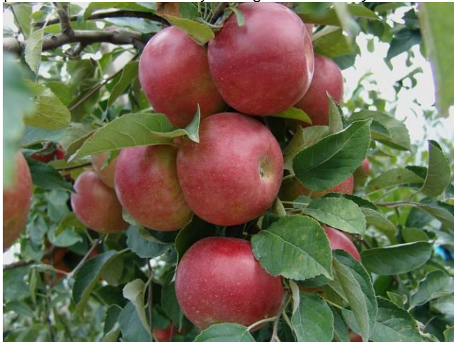
Fig. 4 Fruits from well trained and healthy apple trees tolerant on Erwinia amylovora Burill. Winslow